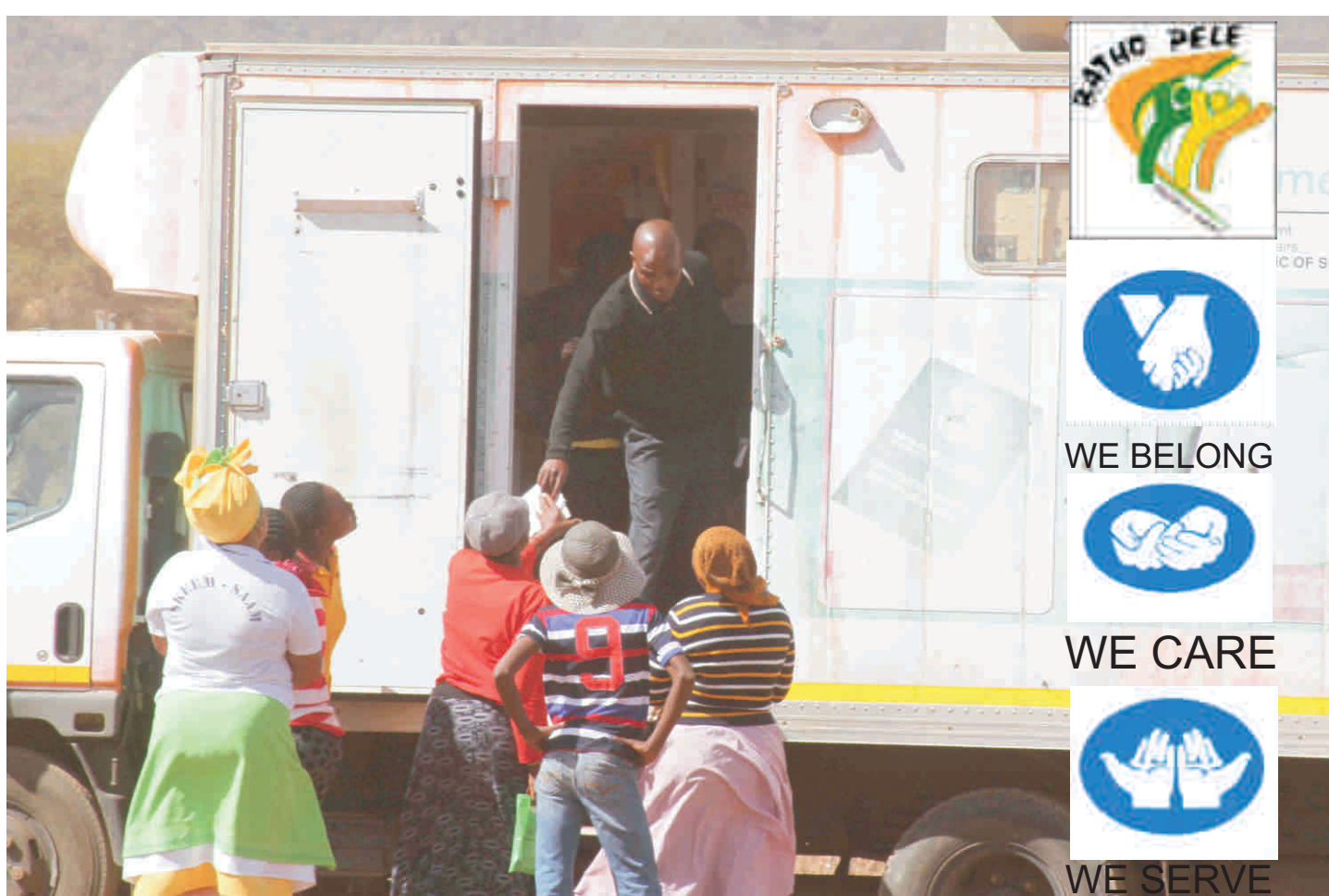
Department of Home Affairs offering services

The Census Report confirmed that government is on the right track with 85.9% of people having access to clean running water in 2011 as compared to 62% in 1996. 87,5% of people having access to electricity as compared to 62% in 2006. However, welcomed were ctiticisims that a substantial number of communities are still living without water and sanitation and as municipality we will ensure that we accelerate the pace.