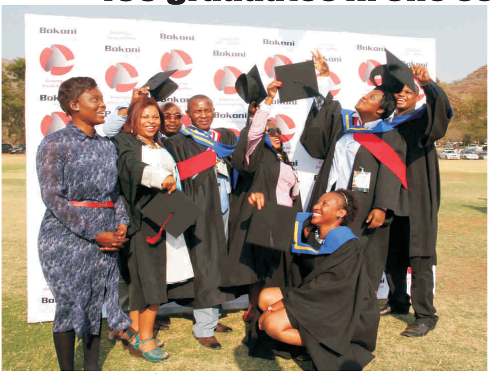
Mayor with graduate of Bokoni Platinum Mine

t is only through the power of God that today we are able to celebrate the success of the graduate. God has given us the power to realize our potential so that we can assist others, so today it is not by mistake that we are here, said Rev Mashabane, he was addressing over 400 graduates from Bokoni Platinum Mine at Atokia Village on the 2<sup>nd</sup> of September 2015 during a graduation ceremony organized by the mine. These trainings are offered and conducted at the mine. accredited by external sources like the Mining Qualifications Authority (MQA), and varies from Adult Education and Training (AET) to Further Education and Training (FET) related courses.